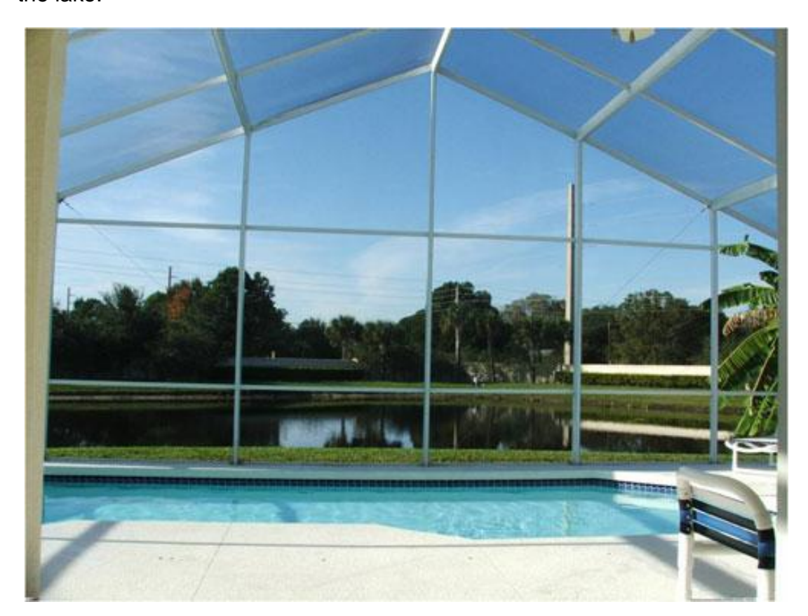
View from the main living room

A large westerly facing lanai ensures that you have the sun for most of the day but particularly in the afternoon until it sets – some wonderful sunsets can be seen from the lanai. There are wonderful views over the lake at the rear of the property, which as previously mentioned, is not surrounded by houses and gives a tranquil setting to see the amazing wildlife which lives on and around the lake.